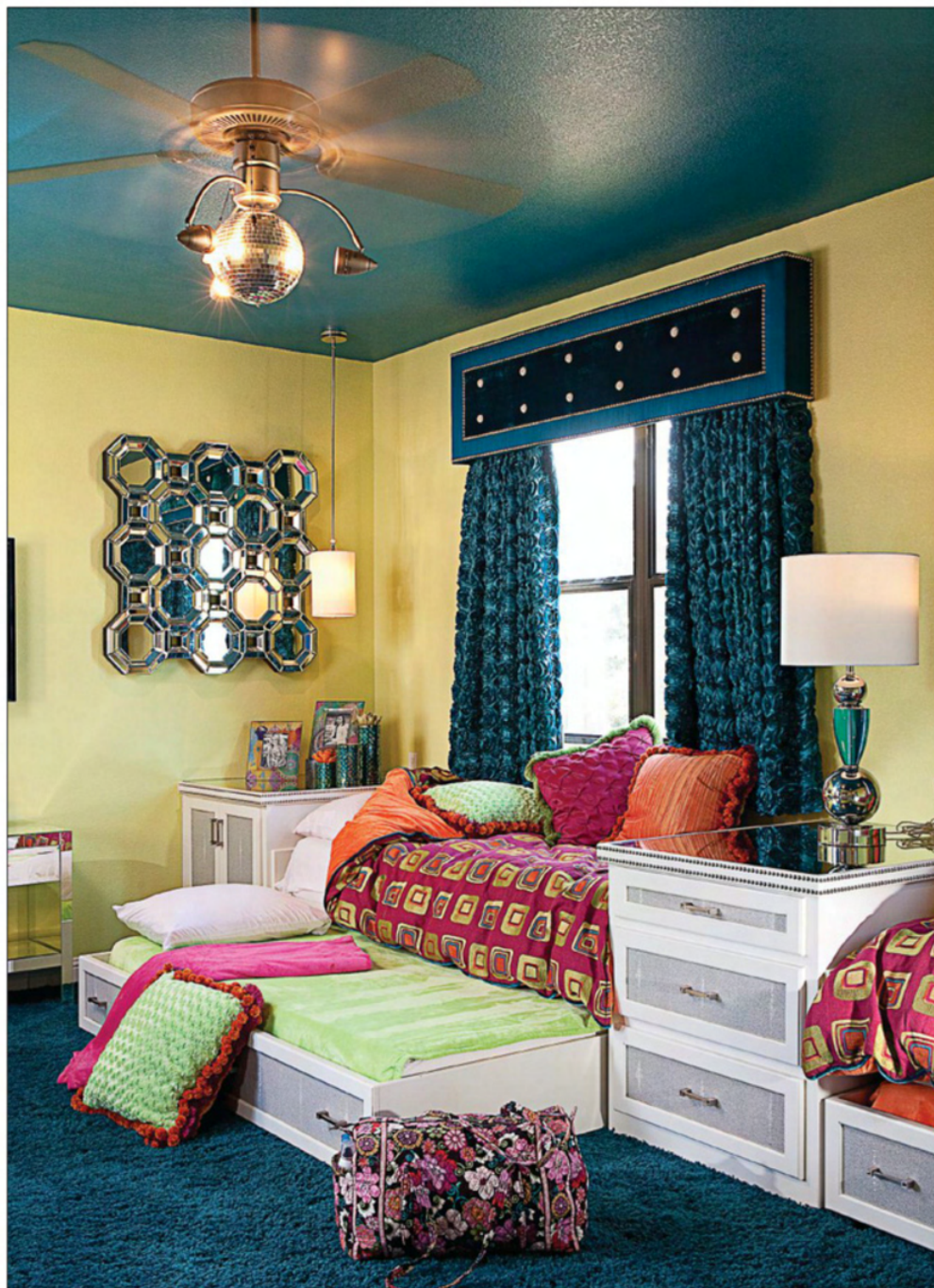
A strobe-light disco ball lights the glam girls' bunkroom, just for fun. On the practical side, the eight trundle beds glide on industrial rollers. Cabinet insets are styled with a beaded wallpaper to complement the rhinestone buttons on the cornice window treatment. In a house built for playing hard and sleeping well, all the bedrooms feature blackout draperies.

Cabinetry finishes Tommy Dyke, Austin's Finest Finishes; 512-944-3468 or austinfinestfinishes.com