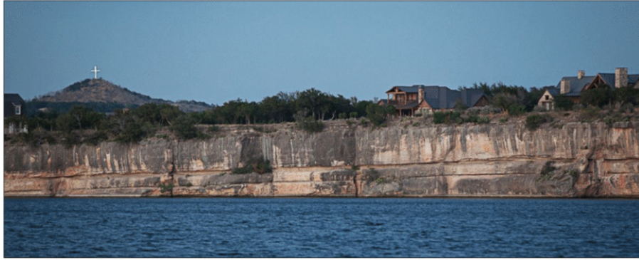
The lake — and cliff — view from the Semmelmann weekend home is what drew them back to the site that was devastated by fire in 2011. Not one but two Green Egg grills, below, in an outdoor kitchen make it easy for Marc and Susan to feed a crowd on their patio.