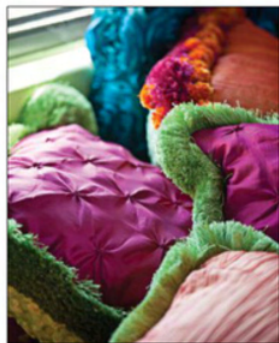
Custom-made pillows in the girls' bunkroom coordinate with the room's bright paint and bedding.