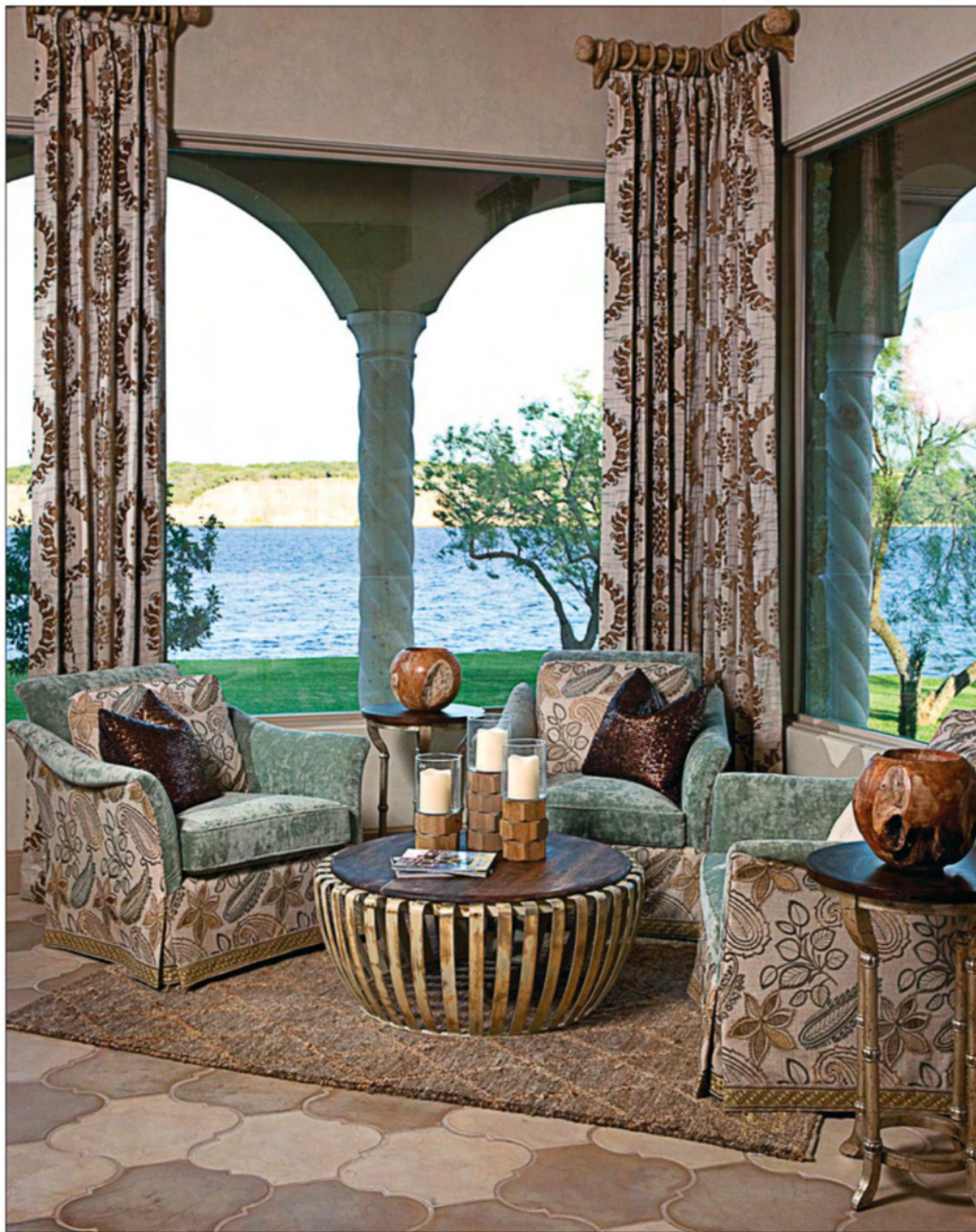
A grouping of swivel chairs from Grandeur Design has the best view in the house. The draperies were manufactured in the company’s workroom in Decatur. The pillows coordinate with the copper penny tiles on the kitchen backsplash and stair risers. Daughter Madeleine Semmelmann painted and distressed the coffee table. The tile flooring was inspired by a small Arabesque concrete tile that Susan had manufactured on a large scale. The shift in color from khaki to bone gives it a movement similar to that in the wall finish.

Peruvian wooden columns in the kitchen, under-lit onyx counters on a bar made from a deconstructed antique cabinet, a bathtub in the shower, a wall of vintage mirror glass broken into pieces and seamed together