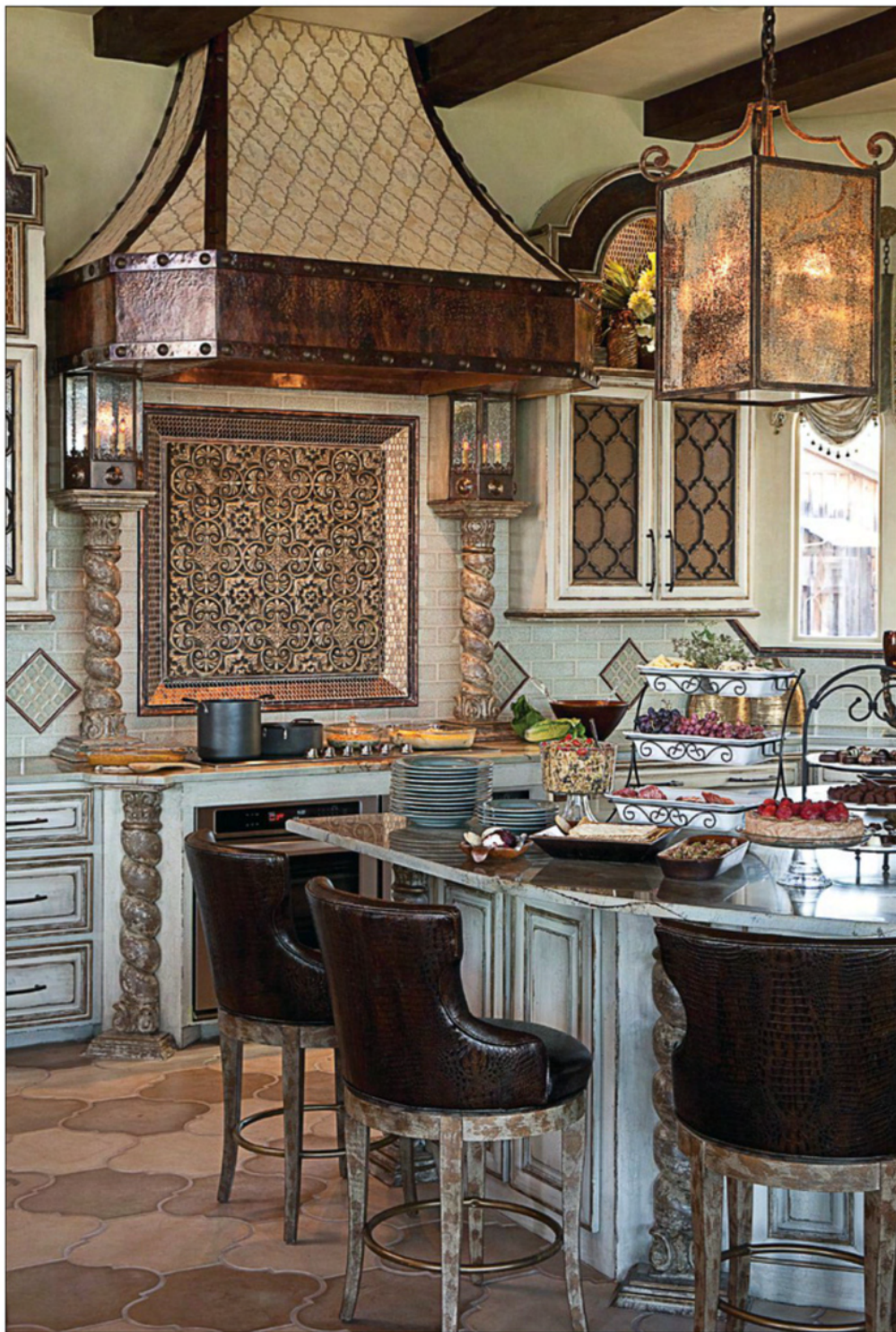
Wasabi quartz covers the kitchen island and countertops. The backsplash features 3- by 9-inch glass tiles set in a brick pattern that abuts the recessed and framed Velmour Moroccan Mosaic Inset.